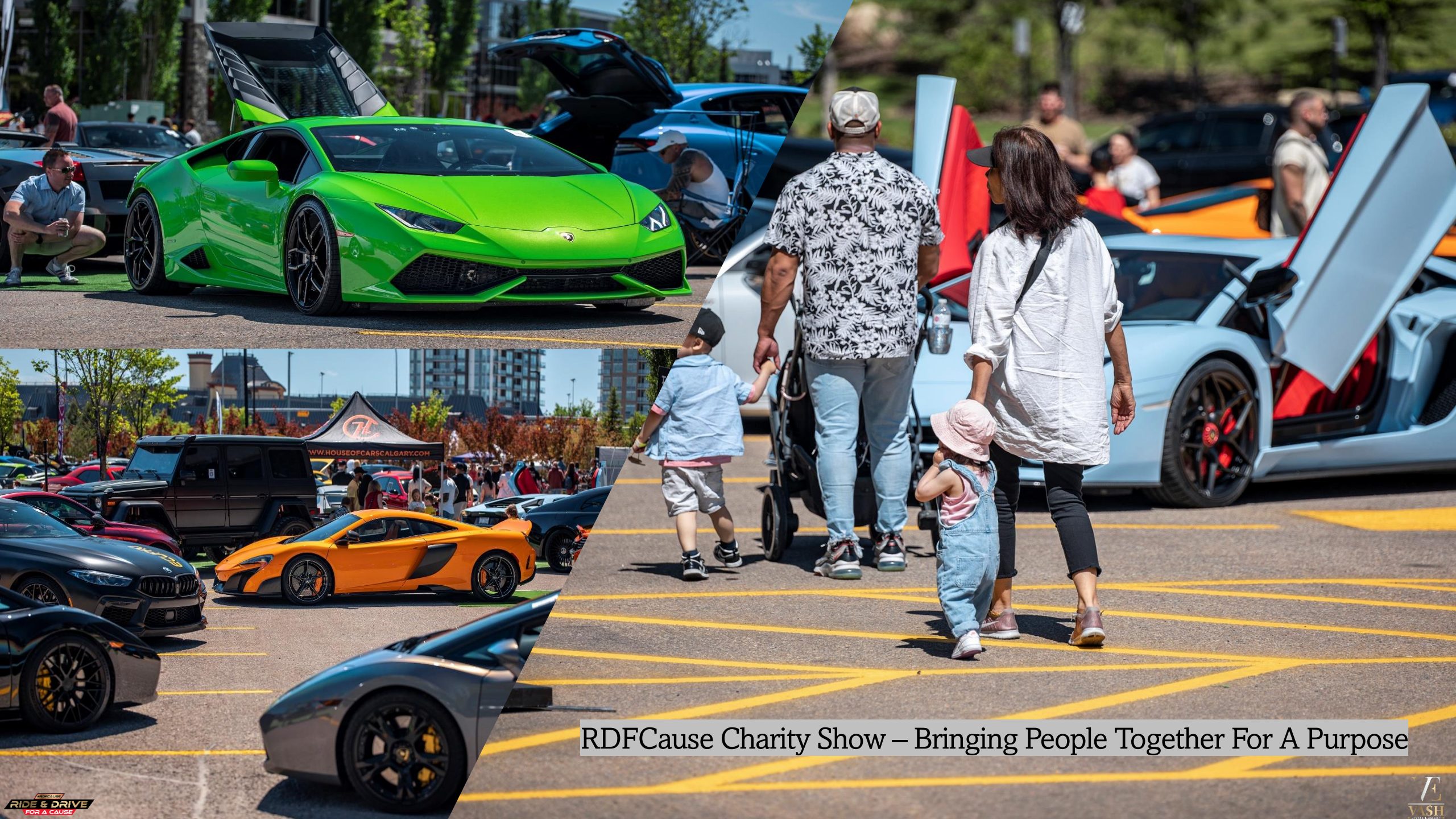
RDFCause Charity Show – Bringing People Together For A Purpose